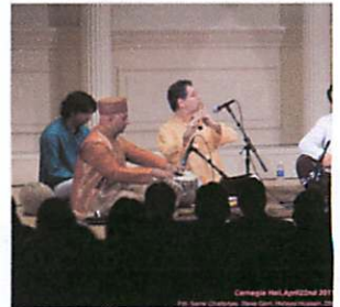
(The Sufi Music Ensemble, held at Carnegie Hall, April 2011, was a sold out event.)